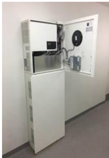
System main door open: