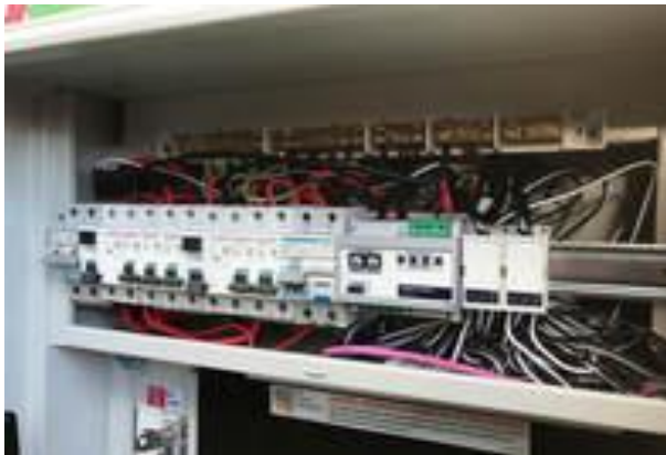
Additional switchboard images: